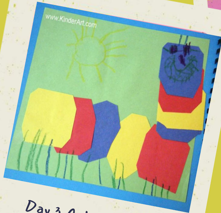
Day 3 Art project.